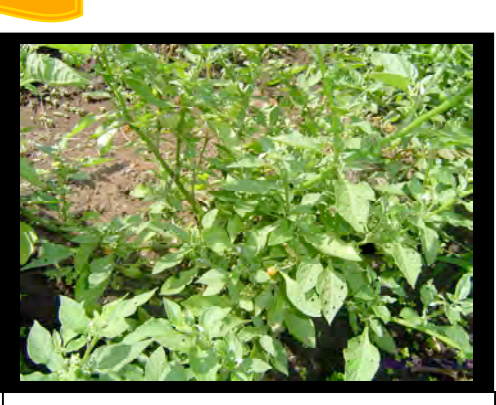
Figure 3: Solanum villosum

Despite what is already in place, there is still a lot yet to be done in terms of research to be able to develop the African vegetable nightshades into commercial crops. If they are promoted, they can play a major role in alleviating poverty in Africa because they can be consumed by everyone and have a high nutritional value in addition to medicinal properties. We need support and your indulgence to promote the vegetable nightshades that are NOT deadly .