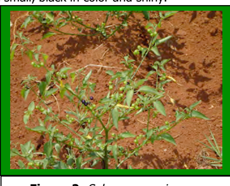
Figure 2: Solanum americanum

In East Africa, the demand for the broad-leafed vegetable nightshade has increased tremendously and the crop has found its way to the major food stores in the region. In order to meet the increasing demand of this vegetable, there is a need to develop production packages to increase the yield and total production not only for local consumption, but also for export. A number of initiatives have been established to promote the production and consumption of