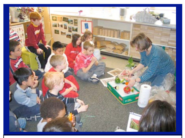
Figure 1: Looking at different Solanaceae family members.

bioinformatics-related projects. A staff member of SGN acts as project mentor for each student to help them learn the various programming skills necessary to develop their projects. As part of this internship, they also attend weekly seminars held at the Boyce Thompson Institute (BTI) that are given by plant scientists from Cornell and BTI for students who participate in the larger summer internship program sponsored by the NSF-Plant Genome Research Program. Information about the 2005 bioinformatics summer interns can be found on SGN at http://www.sgn.cornell.edu/about/Summer_Internship_2005.pl.